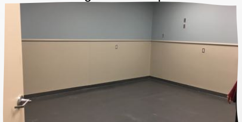
Ergonomic and sanitation friendly flooring is installed and the space is ready for shelving for dry goods storage.