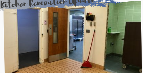
Before: the space that was occupied by the old cooler and freezer