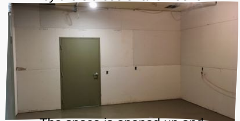
The space is opened up and existing walls are updated.